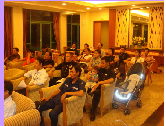
Participants in the Neighborhood Sensitization Program in Jakarta