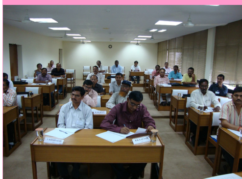
Participants of the training program

The participants were very keen in understanding the whole mechanism behind disaster risk reduction and the respective roles of various stakeholders. A group exercise was also given to the participants for better understanding of issues and challenges before various stakeholders and their respective roles. The participants were divided in six groups – the organization, district administration, medical team, community and local leadership, media team and state and central government. Each group discusses about their respective roles on the occurrence of a particular disaster. The discussion came out with a better understanding and coordination amongst the stakeholders. The participants requested for more similar exercises in future. GFDR will propose to conduct a separate program on disaster management for mine workers and management at IICM.