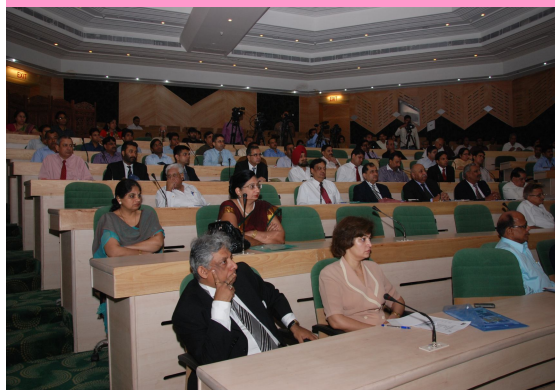
Delegates from different organizations attending the conference