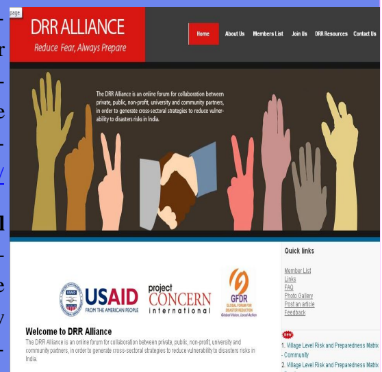
The DRR ALLIANCE on the webpage

GFDR congratulates Project Concern International (PCI), India for initiating and facilitating a collaborative approach towards promoting a risk free community. We hope DRR Alliance as a community of organisations will grow manifold and enrich the country with qualified human resource for disaster mitigation.